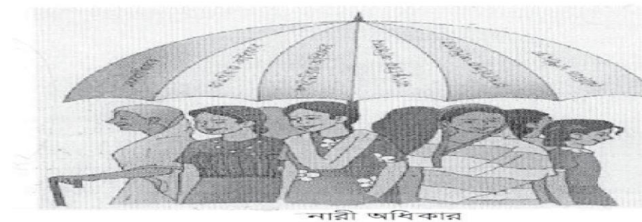
Figure 3: All women regardless of age, religion and ethnicity under one umbrella of development (Patwari et al. 84)

Moreover, the book mentions United Nation’s Universal Declaration of Human Rights in 1948, which entitled women as equal as men in every aspect of life, freedom, education and property (Patwari et al. 84). It must be mentioned, the notion of ‘equity’ instead of ‘equality’ was upheld by many Muslim states at the UN Women Conference in Beijing 1995. The Vatican and conservative Muslim states were in agreement there (Gerle 15). They oppose equal human rights to women in the name of so-called equity, when they only want to subjugate women. However, Bangladesh as a state has always been in support for ‘equality’ for women since its first constitution in 1972. The book provides illustrations of women under the umbrella of development (see fig. 3).