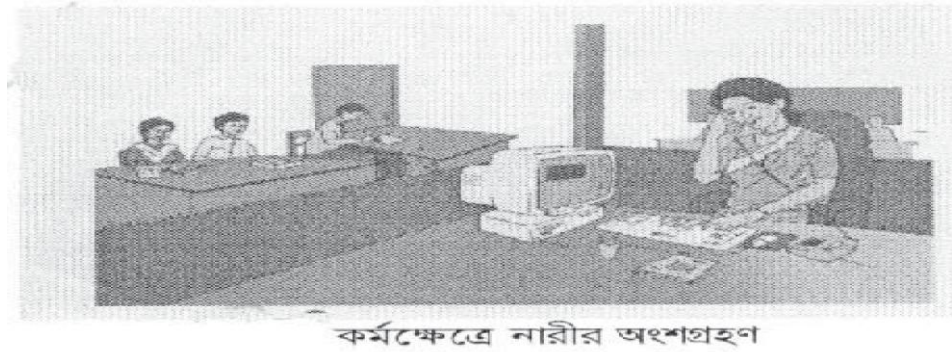
Figure 5: Equal participation of women in workplace. (Patwari et al. 86)

The above illustrations, certainly, works to inspire women. The pictures assure women of their equal rights provided by the law. In fact, the constitution of Bangladesh has enshrined secular Human Rights for its both male and female citizens in every aspect of society. The book also features an illustration (see fig. 5) of women working in an official environment.