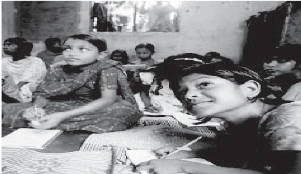
Figure 1: Deprived children are receiving education.