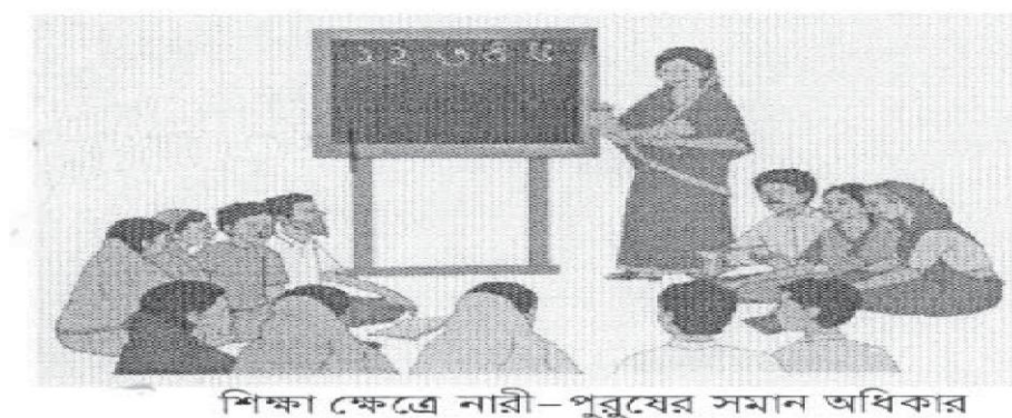
Figure 4: Equal rights of education for men and women. (Patwari et al. 85)

The book also presents an illustration of an adult education class where women, regardless of age and gender, can receive education side by side with men (see fig. 4).