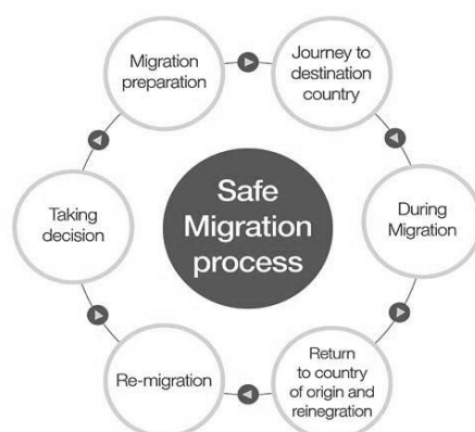
Figure 1: Safe Migration Process

it is called internal migration and when people migrate from their country of origin to another country is called overseas or international migration. The present study is about the second type of migration. People may migrate for social, economic, political or environmental cause. There are some factors behind migration namely push factors and pull factors. Push factors encourages people to leave the place where they live as such poverty, unemployment, natural disaster etc. On the other hand pull factors attract people to move another place such as better living standard, employment opportunity etc. When a migrant worker migrates to another country safely, works there for certain time period and come back to his/her country of origin by ensuring a better and sustainable livelihood is called Safe Migration. Safe migration is a step by step process including taking decision to migrate, migration preparation, journey to destination country, during migration, return to country of origin and reintegration. All these steps can be categorized into three phase's namely a) pre-departure stage which includes taking decision to migrate and migration preparation b) post-arrival stage which includes journey to destination country, during migration and c) reintegration stage includes return to country of origin and reintegration as depicted the figure below: